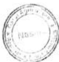
Principal Gargi Agriculture Research & Training Institute

Gargi Agriculture Research & Training Institute